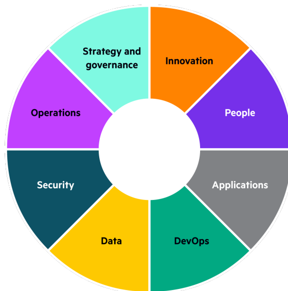
Figure 1. Edge-to-Cloud Adoption Framework

Organizations are looking for the right mix for their hybrid cloud strategy to accelerate, de-risk, and scale innovation, and business outcomes. With their Edge-to-Cloud Adoption Framework, Hewlett Packard Enterprise is providing organizations with one of the most comprehensive set of proven methodologies that identify and develop the critical capabilities needed to achieve an optimal hybrid cloud operating model for their business needs.