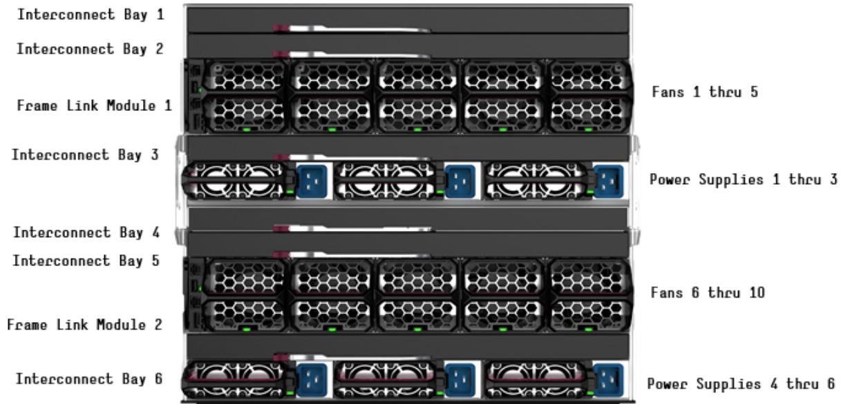
HPE Synergy 12000 Frame - Rear View