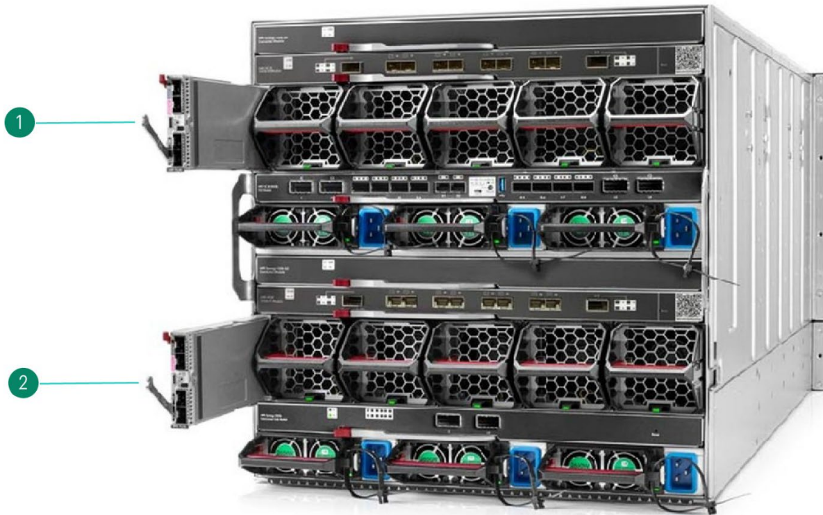
Figure 2: HPE Synergy 12000 Frame - Rear View (Frame Link Modules shown partially extended)