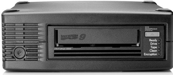
HPE StoreEver LTO Ultrium External Tape Drive