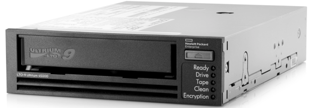
HPE StoreEver LTO Ultrium Internal Tape Drive