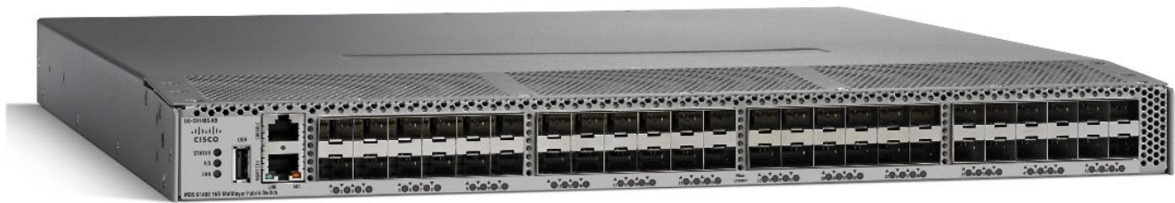
HPE Storage Fibre Channel Switch C-series SN6010C

The HPE Storage Fibre Channel Switch C-series SN6010C supports the C-series Device Manager quick configuration wizard, which allows it to be deployed quickly and easily in networks of any size. Powered by C-series MDS 9000 NX-OS Software, it includes storage networking features and functions and is compatible with C-series SN8500C/SN8700C (MDS 9700) Series Multilayer Directors, C-series MDS 9100 series Multilayer Fabric Switches, MDS 9200 series Multi-service Switches, and MDS 9300 series Multilayer Fabric Switches providing transparent, end-to-end service delivery in core-edge deployments.