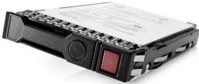
Smart Carrier (SC)