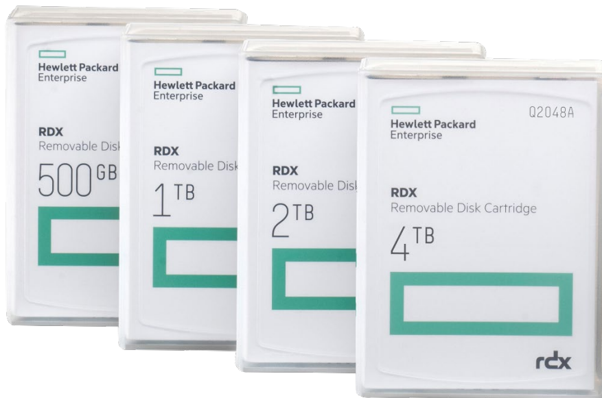
HPE RDX Removable Disk Cartridge

The HPE RDX Removable Disk Cartridge is a rugged and removable hard disk drive cartridge that provides easy offsite data protection and quick access to your most critical data. When used with an HPE RDX internal or external dock, the HPE RDX backup system becomes an ideal entry level backup solution for small businesses with a single server or branch offices with little or no IT resources