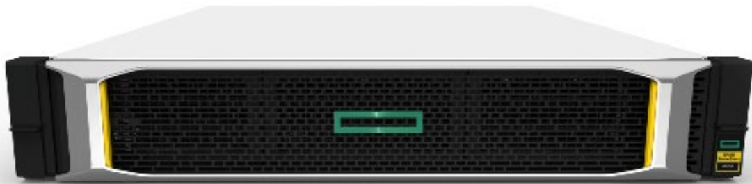
HPE MSA 2050 SAN Storage