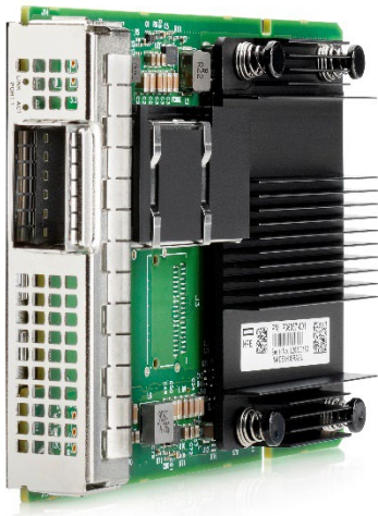
P/N P31323-B21, P31323-H21 (for Gen10 Plus only)

HPE HDR InfiniBand 200 GB 2-port QSFP56 and HPE HDR InfiniBand 200 GB 1 or 2 port QSFP56 OCP3 Adapters are supported on HPE ProLiant Gen10 Plus servers only.