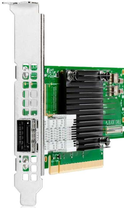
P/N P06250-H21, P06250-H21, P23665-B21, P23665-H21 (HDR100 1-port ConnectX®-6)