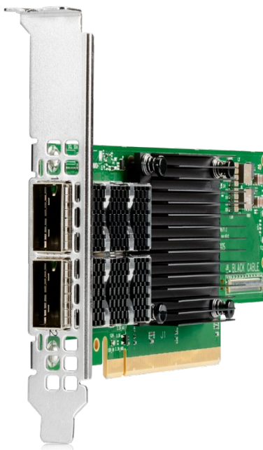
P/N P06251-H21, P06251-H21, P23666-B21, P23666-H21 (HDR100 2-port ConnectX®-6)