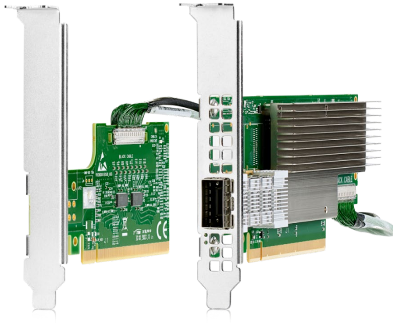
P/N P06154-H21, P06154-H21, P23664-B21, P23664-H21 (HDR 1-port ConnectX®-6) + P06154-H22/23 with Gen10