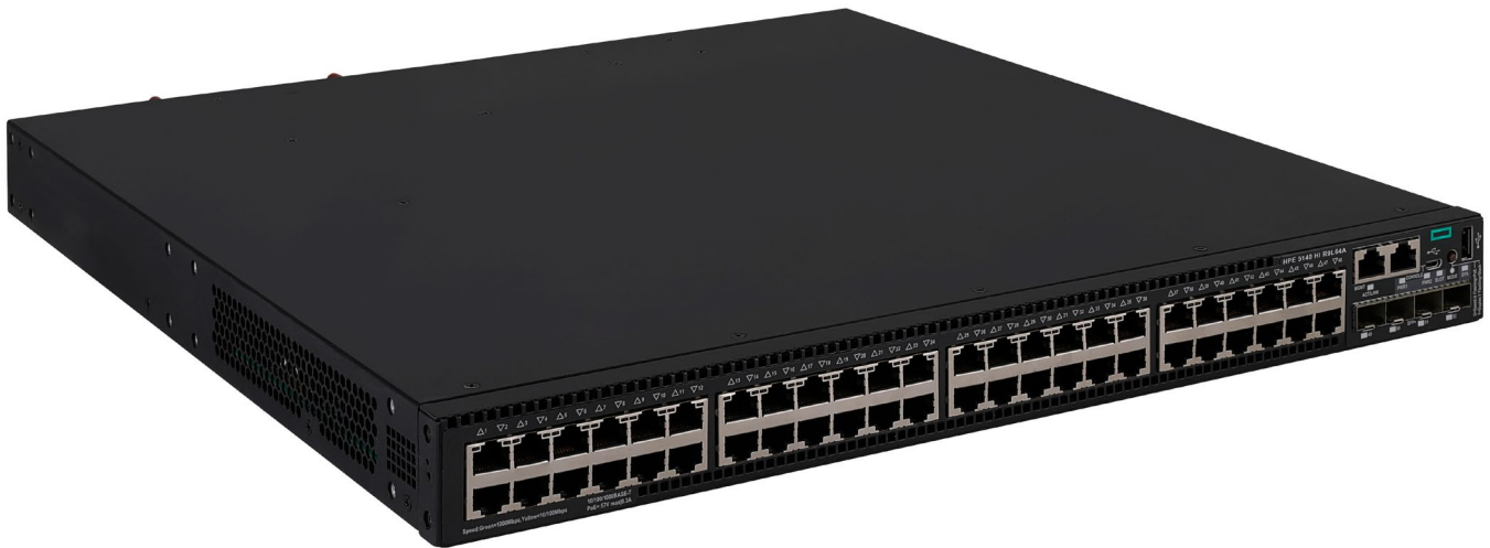
HPE FlexNetwork 5140 HI Switch Series

This switch series also includes Smart MC at no additional cost and combined with Intelligent Management Center (IMC), provides both embedded network management, enhanced network visibility and automation