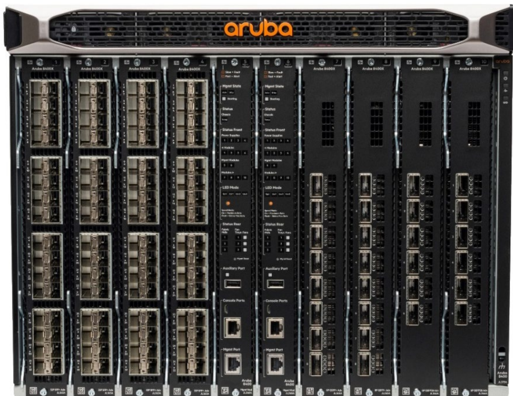
HPE Aruba Networking CX 8400 Switch Series

The CX 8400 provides carrier class high availability with industry-leading line rate 10GbE/25GbE/40GbE/100GbE connectivity in a compact 8 slot chassis. Together with fixed form factor solutions such as the HPE Aruba Networking CX 8320 Switch and the HPE Aruba Networking CX 8325 Switch, the CX 8400 rounds out HPE Aruba Networking's core, aggregation and data center switching portfolio with a solution that ensures higher performance and higher uptime for the most demanding enterprise networks.