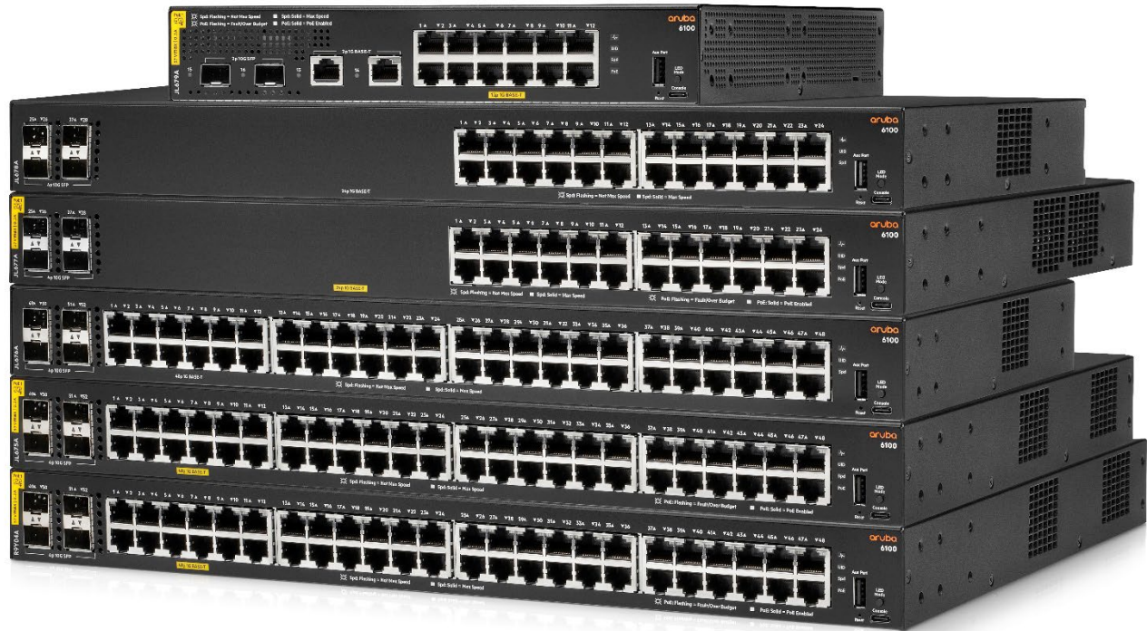
HPE Aruba Networking CX 6100 Switch Series

The HPE Aruba Networking CX 6100 Switch series supports management choices that include Web GUI, CLI, cloud-based and on-premises HPE Aruba Networking Central, so you can choose the best fit for your needs today with flexibility to change without replacing hardware. With enhanced access security, traffic prioritization, and IPv6 support, the HPE Aruba Networking CX 6100 Switch series also simplifies ownership and brings peace of mind with switch software embedded with no subscription required to enable and a Limited Lifetime Warranty.