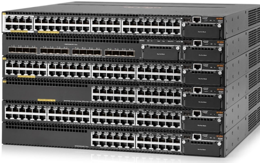
Aruba 3810M Switch Series

The 3810M is easy to deploy, use and manage using Aruba AirWave or Aruba Central. Aruba ClearPass offers centralized security and external captive portal support. The switches offer a limited lifetime warranty.