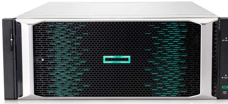
HPE Alletra 9000 (4-Node all NVMe Storage Base)

HPE Alletra 9000 is ideally suited for mission-critical workloads with extreme latency sensitivity and availability requirements. It's ideally suited for an environment that requires a dense data center footprint. It overcomes the agility versus reliability tradeoff between the public cloud and traditional enterprise storage by providing a modern, as-a-service experience through HPE GreenLake, combined with intelligence and automation that ensures applications are always-on and available. It features a unique, massively parallel, multi-node, and all-active platform with all volumes active on all media, controllers, and host ports always. Achieve unconstrained scalability for consolidating traditional and next-generation mission-critical applications with predictable performance and ultra-low latency, backed by a 100% availability guarantee. Also eliminate cost and complexity from business continuity and disaster recovery with fully Active Bidirectional Replication.