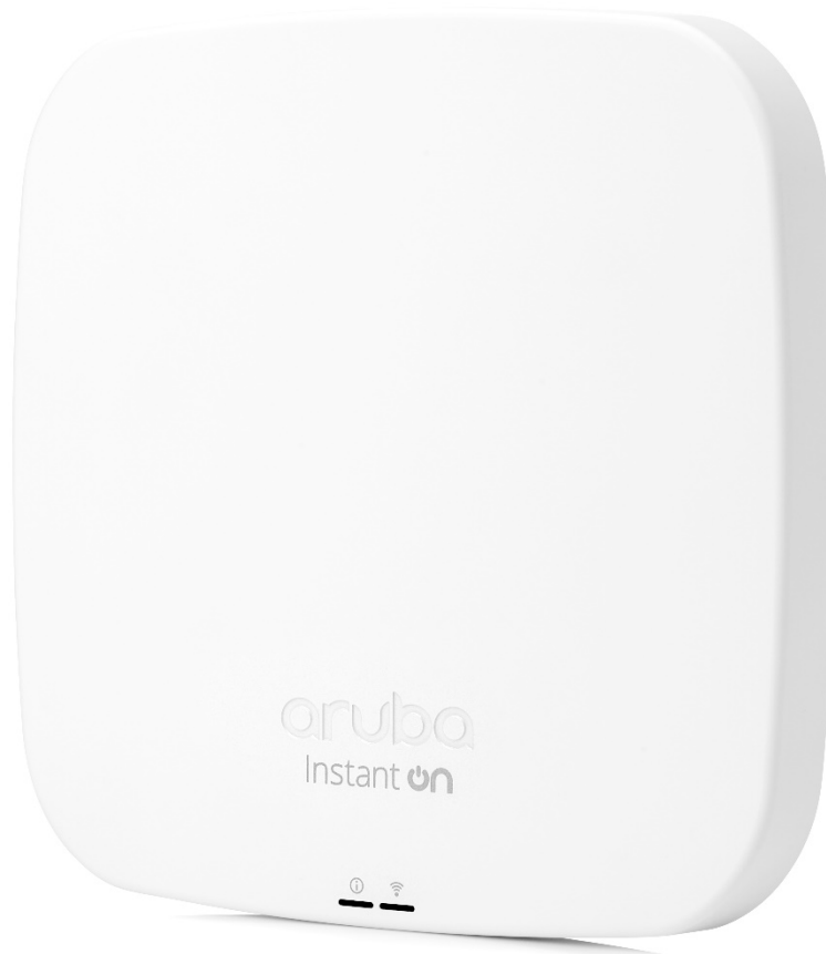
Aruba Instant On AP15 Indoor Access Points

Whether you own a design firm or a tech start up, your employees and customers are relying on the network for almost everything they do. And because Wi-Fi plays such a crucial role today, you need a purpose-built solution that keeps your business on the go. Aruba Instant On Access Points (APs) are easy to deploy and manage—with a quality look and feel at an attractive price point.