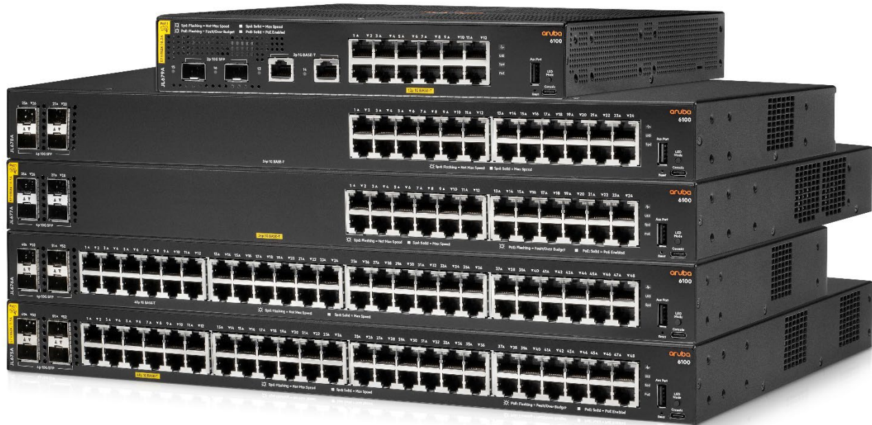
Aruba CX 6100 Switch Series

The CX 6100 series is based on the Aruba ASIC architecture with the programmable AOS-CX operating system used across the entire Aruba CX portfolio for a more consistent, more efficient operator experience. This layer 2 switch series has convenient built-in high speed uplinks with up to 370W of PoE to support IoT devices such as security cameras and wireless APs, and includes a compact and fanless model ideal for use in quiet work spaces. With robust QoS, support for static routing, and IPv6, the CX 6100 also simplifies ownership with no software licensing requirements.