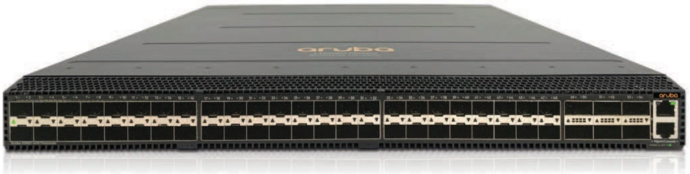
Aruba CX 10000 Switch Series

Notes: 1 Supported in future software release.