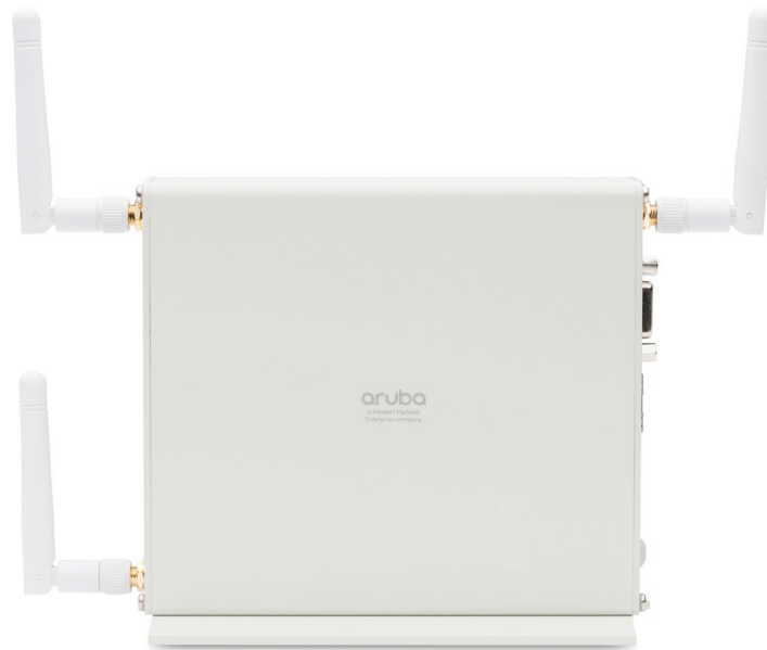
Aruba 501 Wireless Client Bridge Series

The 501 Wireless Client Bridge integrates into the Aruba Mobile First solution architecture and is interoperable with the IEEE 802.11a/b/g/n/ac wireless network infrastructure in a multi-vendor environment.