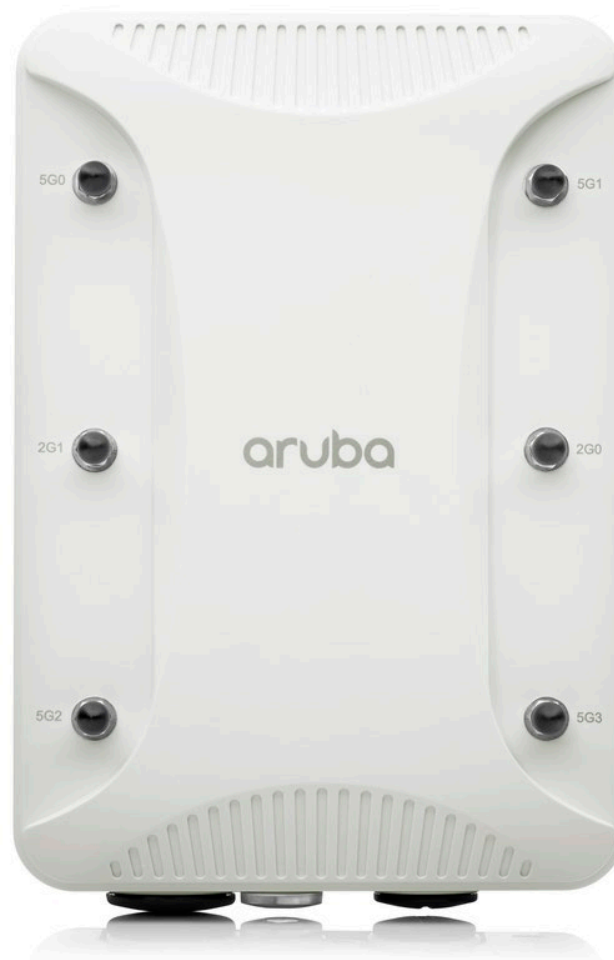
802.11ac Wave 2 for harsh, weather-protected environments

With a maximum concurrent data rate of 2 Gbps (5GHz: 1,733 Mbps and 2.4GHz: 300 Mbps), the 318 Series can quickly add capacity to existing or new wireless networks in temperature-sensitive, dust-ridden, or other extreme environments. The 318 Series also comes with multi-user MIMO (MU-MIMO), 4 spatial streams (4SS), and optional 160 MHz channel bandwidth (VHT160) for the highest performance and density applications.