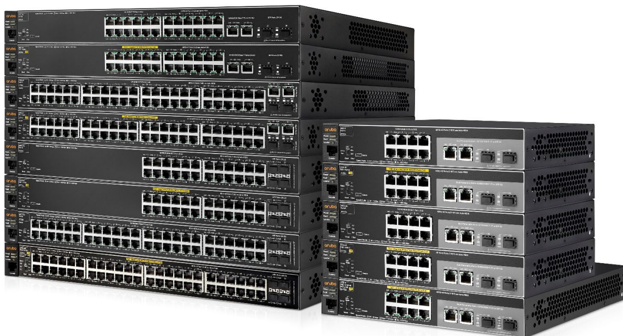
Aruba 2530 Switch Series

The Aruba 2530 Switch Series is easy to deploy, use and manage using Aruba AirWave or Aruba Central. Aruba ClearPass offers network access control (NAC) and external captive portal support. The switches include a Limited Lifetime Warranty.