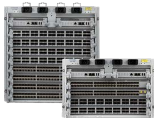
Arista 7500 Series Chassis

The 7500 chassis provides room for two supervisor modules, four or eight line card modules, four power supply modules, and six fabric modules. The 7504 chassis fits into 7 rack units while the 7508 chassis fits into 11U of a standard data center rack. Supervisor and line card modules plug in from the front, while the fabric and power supply modules are inserted from the rear. The midplane is completely passive and provides control plane connectivity to each of the fabric and line card modules. The system design is optimized for data center deployments with front- to-rear airflow.