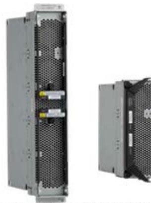
Arista 7500 Series Fabric Modules

At the heart of the 7500E series is the fabric. It interconnects all line cards in a non-blocking architecture irrespective of the traffic pattern providing a full 5.12 Tbps per fabric module. Each line card module connects to the fabric with multiple links and data packets are spread across the links to fully utilize the fabric capacity. Unlike hash-based selection of fabric links, the 7500E architecture provides 100% efficient connectivity from any port to any other port with no drops. The fabric modules are always active-active, provide N+1 redundancy and can be hot-swapped with zero performance degradation. The Fabric Modules for the 7508E and the 7504E are different based on the size of the chassis and both integrate a fan assembly for flexible and redundant cooling.