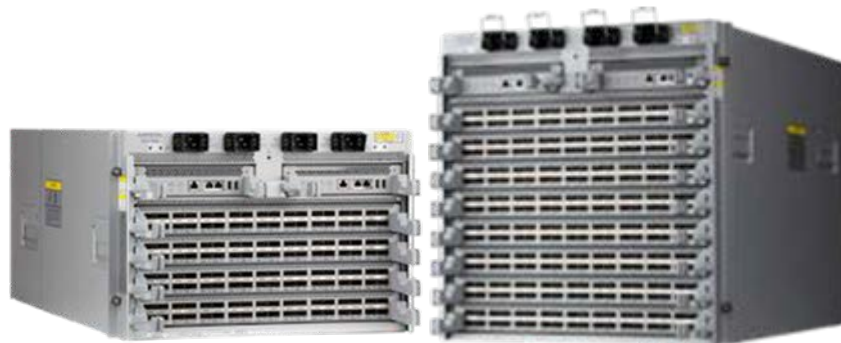
Arista 7500E Series Modular Data Center Switches

With front-to-rear airflow, redundant and hot swappable supervisor, power, fabric and cooling modules the system is purpose built for data centers. The 7500E Series is energy efficient with typical power consumption of under 4 watts per port for a fully loaded chassis. All of these attributes make the Arista 7500E an ideal platform for building reliable, low latency, resilient and highly scalable data center networks.