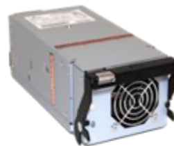
Arista 7500 Series Power Supply

The 7500E series switches are equipped with four 2900W AC power supplies. The power supplies are 2+2 grid redundant and hot-swappable. The power supplies are gold climate saver rated and have an efficiency of over 90% with single stage conversion to the internal 12V DC voltage.