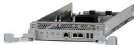
Arista 7500 Series Supervisor

The supervisor modules for the 7500 series run Arista Extensible Operating System (EOS) and handle all control plane and management functions of the system. One supervisor module is needed to run the system and a second can be added for stateful 1+1 redundancy. Each supervisor module takes up only a half slot resulting in very efficient use of space and a higher density design. The quad-core x86 CPU with 16GB of DRAM and an optional SSD provides the control plane performance needed to run an advanced data center switch scaling to over 1,000 physical ports and thousands of virtual ports. A pulse per second clock input port enables synchronizing with an external source to improve the accuracy of monitoring tools.