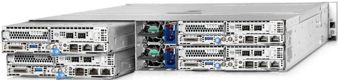
Chassis, back view with 4 nodes