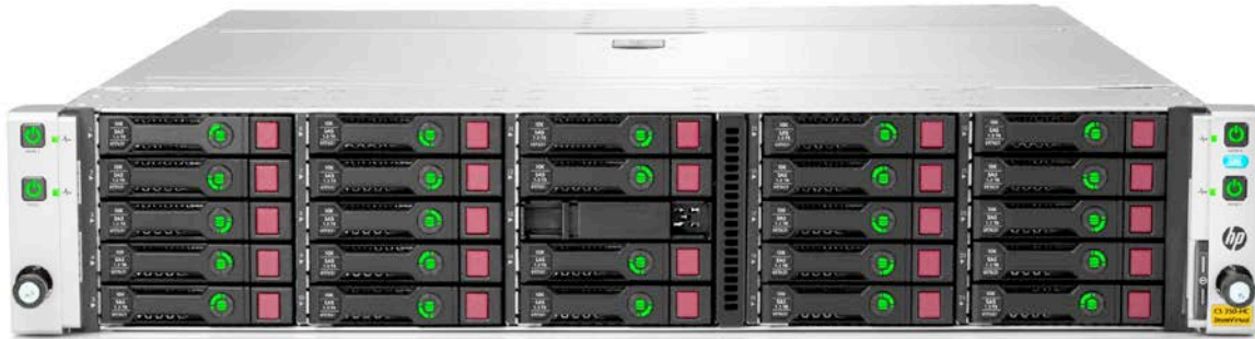
Chassis, front view with 24 drives