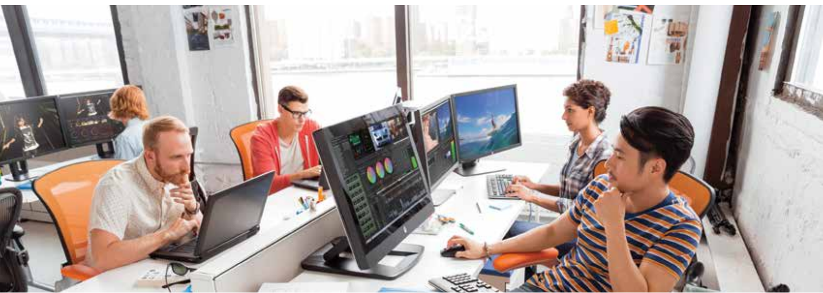
Image pattern recognition

Humans recognize objects, people, or locations seemingly effortlessly. When we see an object for the first time, we study it, memorize its unique visual properties, and make a mental model that stays with us for a while. When we see it again, we try to match the visual properties of the object with those of the models stored in our brains. IDOL uses a similar approach to automate the process of object recognition from images. IDOL provides computer vision algorithms for recognizing repetitive or unusual patterns in images of objects, text, people, and scenes.