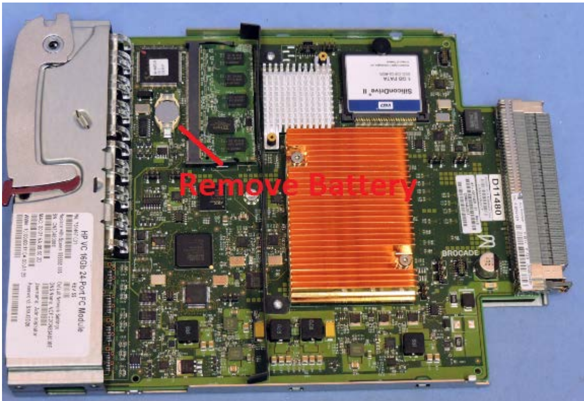
HP VC 16Gb 24-Port FC Module and HP 16Gb FC Module