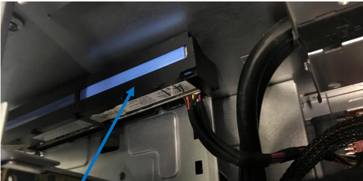
Remove Megacell Module