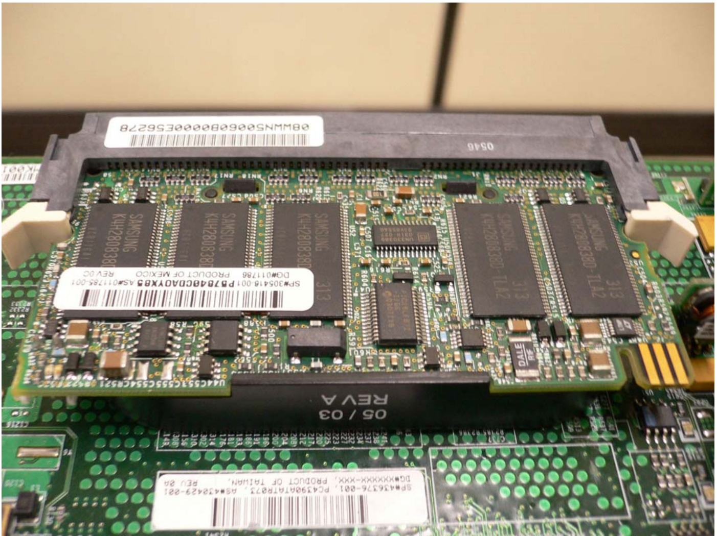
Attachment 2.2 – BBWC Battery removal