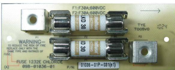
Fuse board PCB